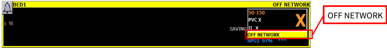
Figure 2. OFF NETWORK condition example in the Central Station Multi-Viewer window with audible and visual alarm indicators (bell icon and flashing title bar)

There have been no injuries reported to GE HealthCare as a result of this issue.